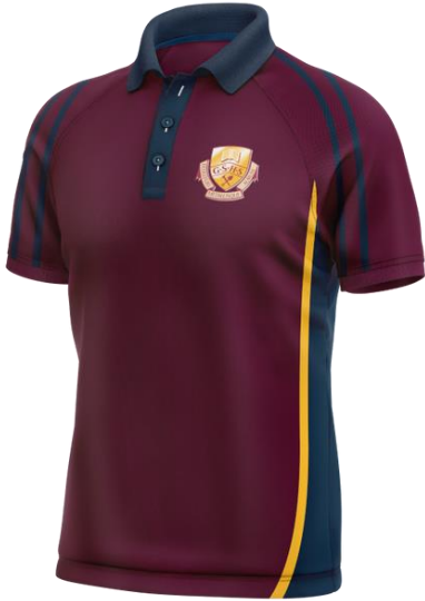
Junior Polo Shirt Years 7-9