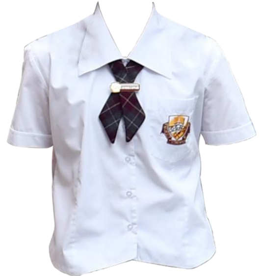
Formal White Blouse & Tab Tie