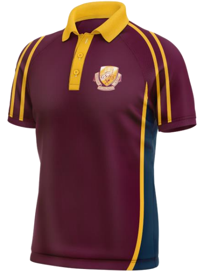
Senior Polo Shirt Years 10-12