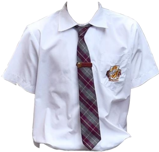
Formal Shirt & Tie