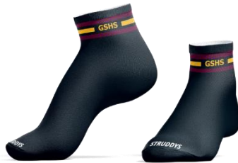
Ankle or Crew socks