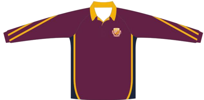
Senior Long Sleeve