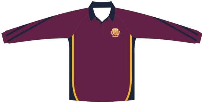
Junior Long Sleeve